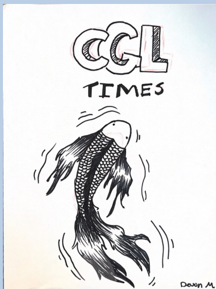
Cover Art by Devon M (Session 2)